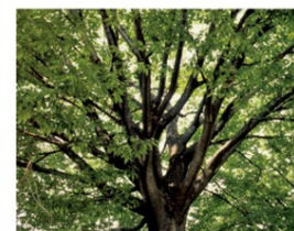
City Tree: Zelkova