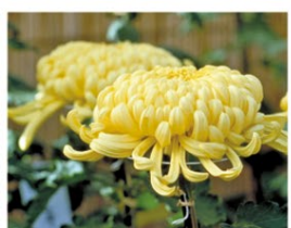
City Flower: Chrysanthemum