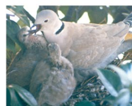
City Bird: Eurasian Collared Dove

City Official Website: http://www.city.koshigaya.saitama.jp/