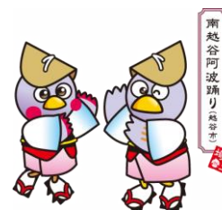
Mascot characters of Saitama Prefecture, Saitamacchi & Kobaton

Fun Fact: In August, the Shin-Koshigaya Station and Minami-Koshigaya Station use the music from the festival to signal train departures.