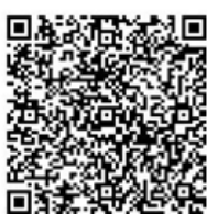
Online Sign Up

Date: 13 th June Saturday 9:00 AM - 12:00 Noon